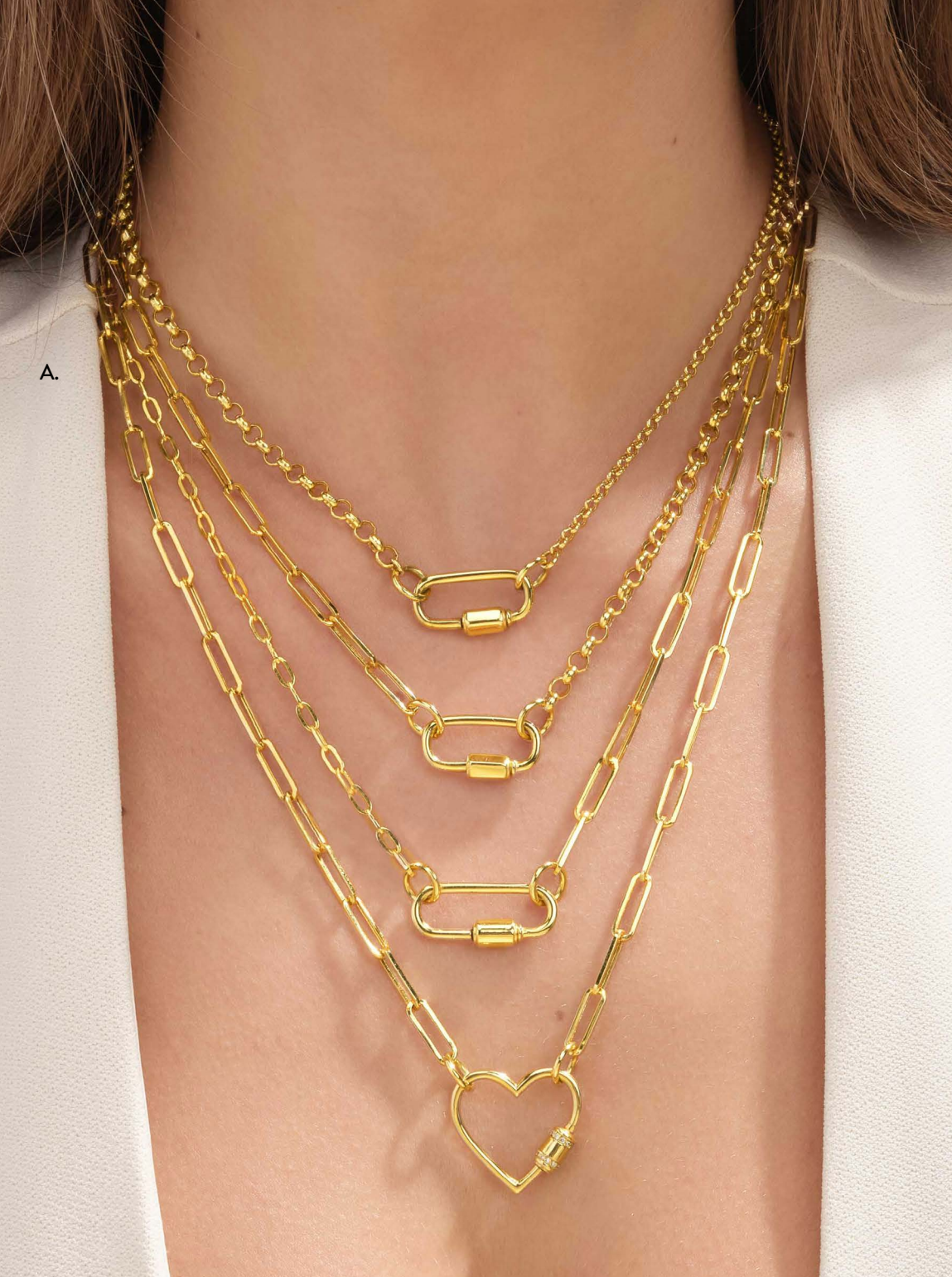
A. 50/50 Rolo + Rolo Split Chain MF040064-14Y_20 $2,319 | Oval Clasp with Hexagon Twist Closure TM023423-14Y $1,170 | 50/50 Paper Clip + Rolo Split Chain MF042674-14Y_18 $2,631 | Oval Clasp with Hexagon Twist Closure TM023423-14Y $1,170 | 50/50 Paper Clip Split Chain MF039680-14Y_20 $2,704 | Oval Clasp Twist Lock TM023306-14Y $1,394 | 3.80mm Split Hollow Paper Clip Chain MZ011084-14Y_20 $2,248 | Diamond Barrel Twist Heart Clasp TM023849-14Y $1,857