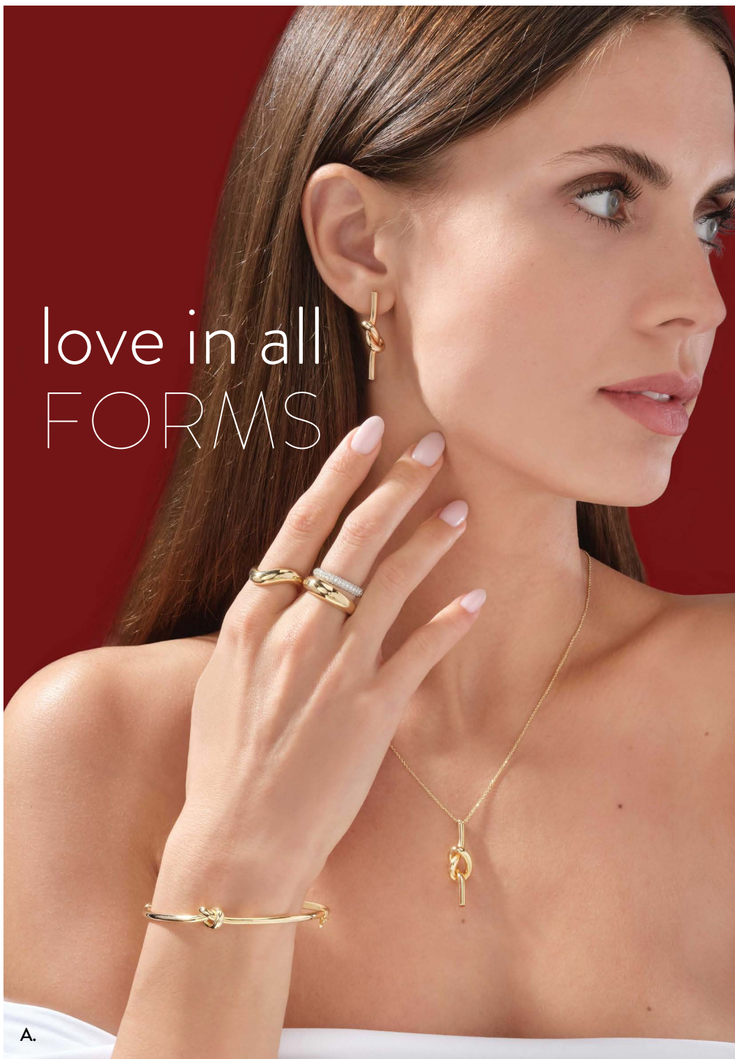
A. Knotted Tube Earrings TM027515-14Y $1,175 | Swirl Band Ring TM024516-14Y_7 $836 | Pave Diamond Stackable Band (3/4tcw) TM024969-14YB_7 $3,521 | Wide Domed Band Ring TM023769-14Y_7 $1,699 | 3mm Love Knot Tube Bangle TM029519-14Y $2,201 | Knot Pendant Necklace TM027516-14Y_18 $1,419